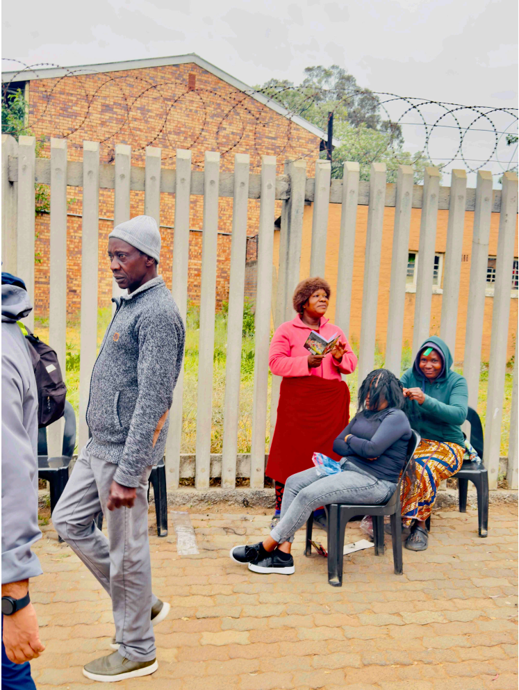
On the Streets of Soweto