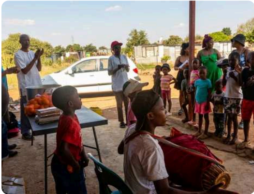
Sunday program and prasadam distribution – Hammanskraal community

Four Sunday programs were held this month and four harinams, each carrying books and the Holy Name into the community. Over 250 plates of prasadam were served per harinama. People receive a meal, but they also receive something they weren't necessarily looking for.