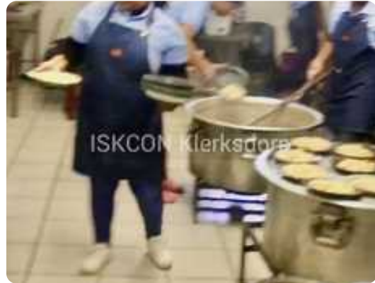
Volunteers at work in the Klerksdorp kitchen

This month the partnership with Food for Life South Africa officially began. Klerksdorp is now an official affiliate organisation – which opens up a proper account for sponsorships, more facility to raise funds, and a stronger foundation to grow the prasadam distribution program.