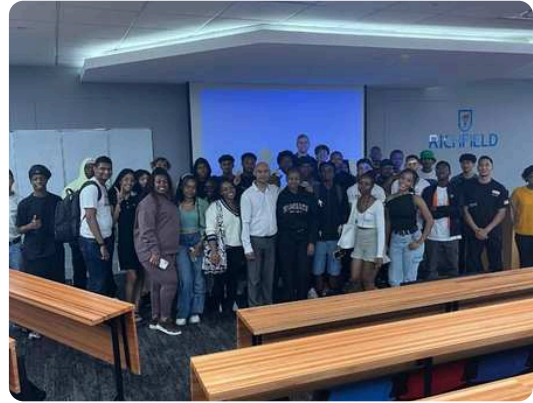
Students at BYS — Richfield campus, Johannesburg

April required some honesty. Maintaining four campuses has stretched what we have. So we are focusing on building depth at the main campus first. A program was also held at North West University — a new connection opening quietly.