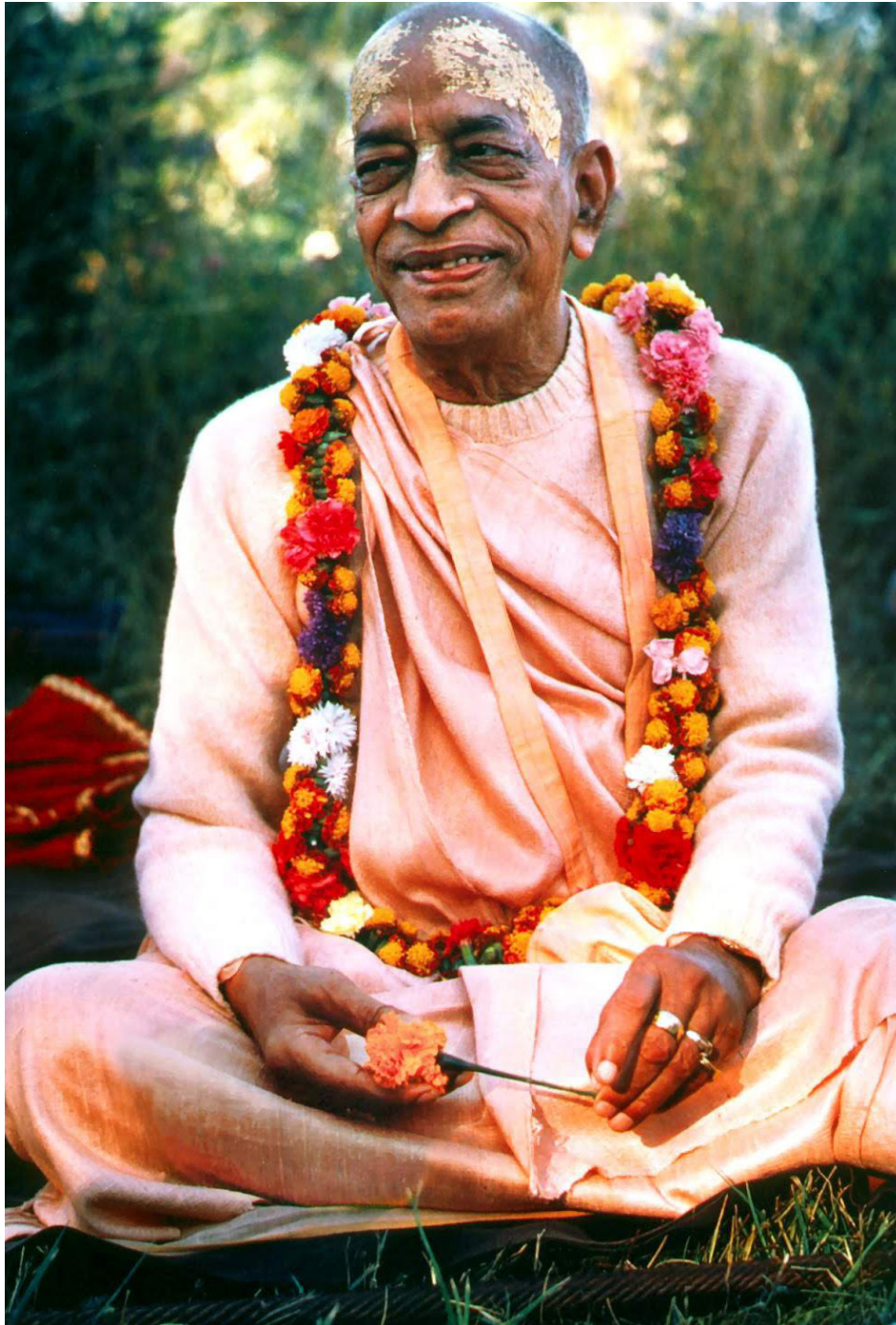
HIS DIVINE GRACE A.C. BHAKTIVEDANTA SWAMI PRABHUPĀDA, FOUNDER-ĀCĀRYA OF THE INTERNATIONAL SOCIETY FOR KRISHNA CONSCIOUSNESS